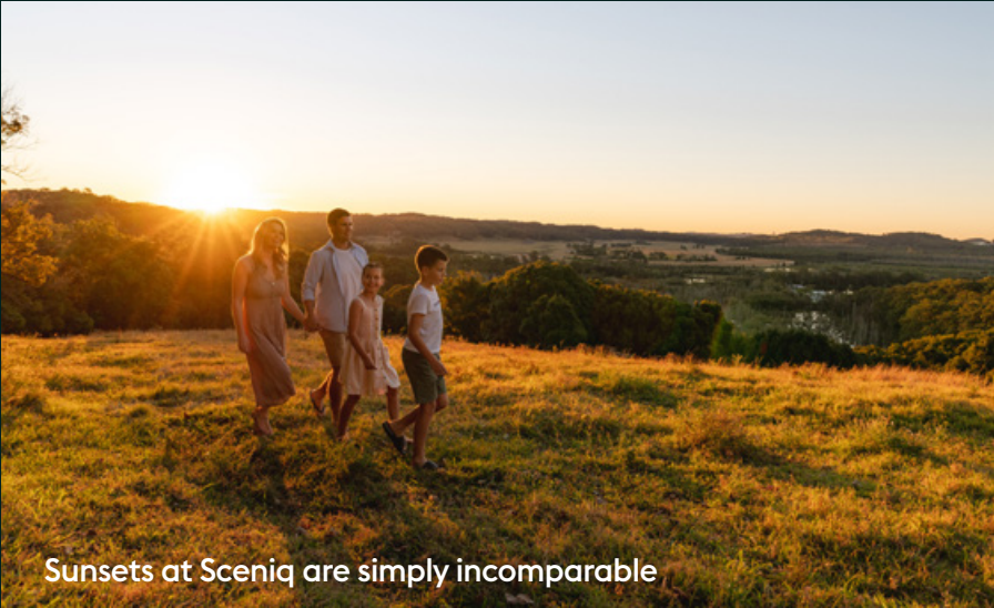
Sunsets at Sceniq are simply incomparable

Stage 3 presents an exclusive selection of 30 premium homesites within a prestigious community. These elevated and expansive sites range from 677m 2 to an impressive 3.108ha, offering abundant space to bring your dream home to life and so much more.